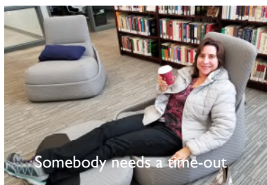
Somebody needs a time-out