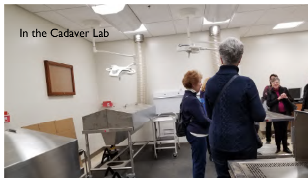
In the Cadaver Lab